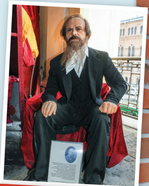
A wax figure at the museum where I work.

Yes, I do! I walk all over the museum. It is very important to wear comfortable shoes.