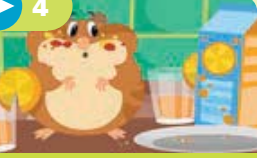
1.2 Grammar animation