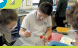
BBC Culture video