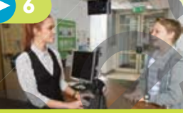
1.4 Communication video