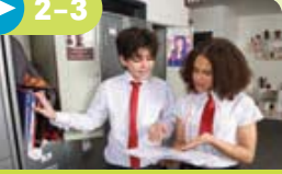
1.2 Grammar video