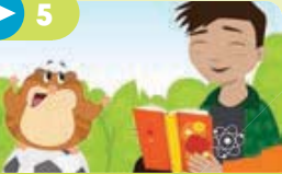
1.3 Grammar animation