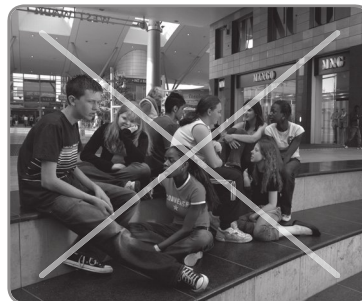
1 Please don't hang out here.