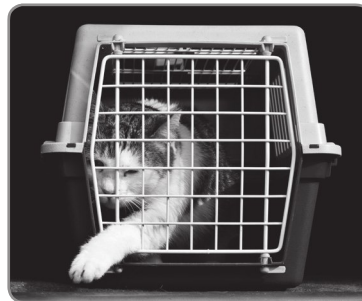
3 ..... my cat.