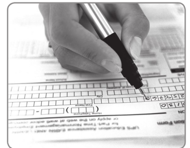
2 ..... this form.