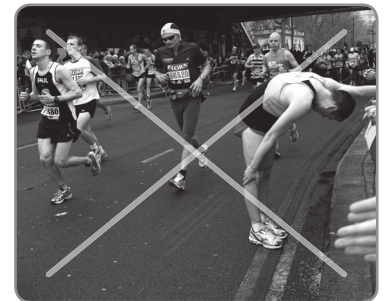
4 ..... You can do it!