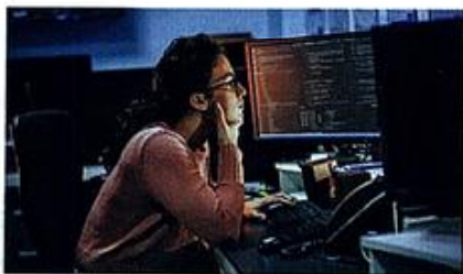
___ computer programmer