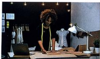
___ fashion designer

D. CATEGORIZE Look at the six occupations. Which types do they match? Write the type number under each photo.