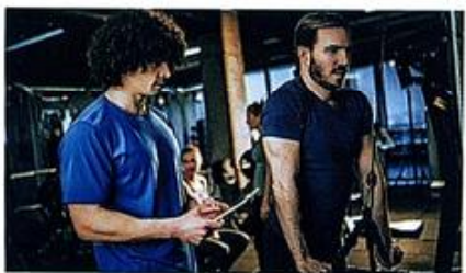
___ personal trainer